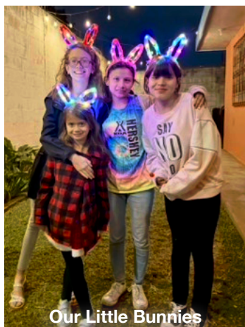
Our Little Bunnies

If you wish to partner with our ministry, tax-deductible donations can be made out to "NACC" with "Guatemala Missions" in the for field and mailed to: