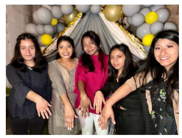
Showing off their graduation rings