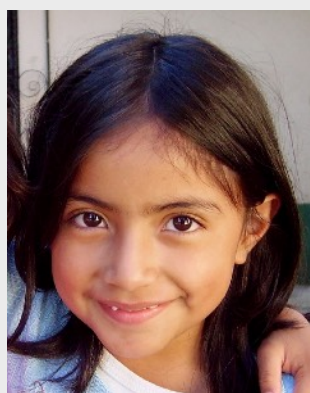
At Casa Shalom 2007