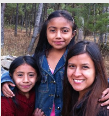
Back at Home with Family 2011