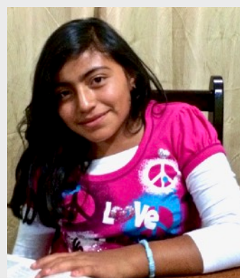
Started to Live with Us 2014